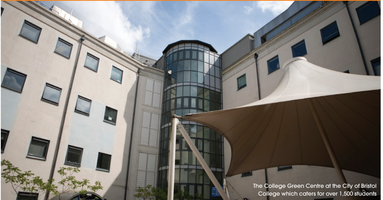
The College Green Centre at the City of Bristol College which caters for over 1,500 students