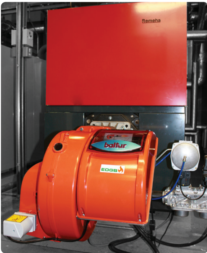
The improved heating installation at the City of Bristol College is highly-efficient and makes use of the latest technology