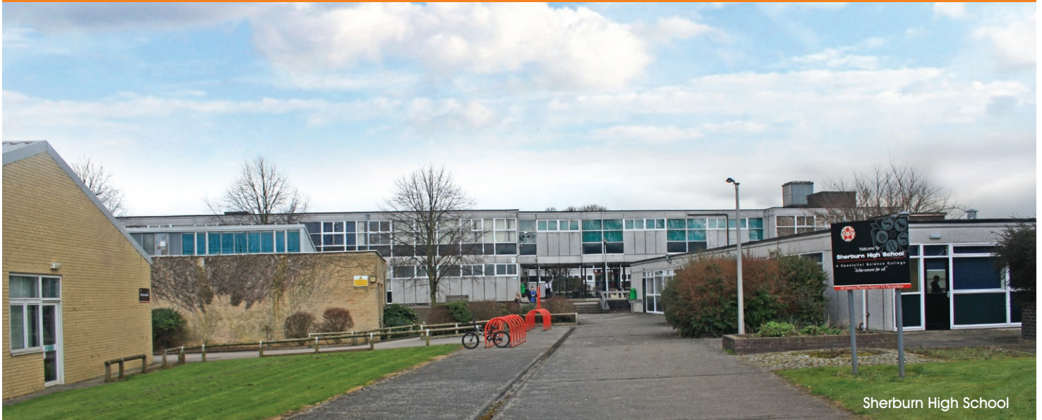
Sherburn High School