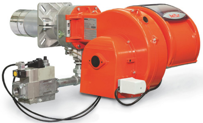
Baltur TBG 210MC burner used in the new heating system for the John Lewis Kingston store